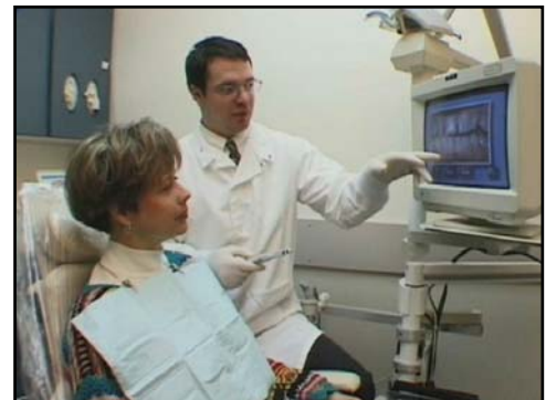
A clear understanding

The intraoral camera allows you to be an active partner in your dental treatment by enabling you to see what we see inside your mouth. With a clear understanding of your dental conditions, you'll be able to make treatment decisions with confidence.